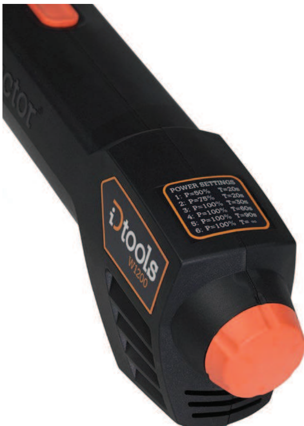
Single-control settings for operating power and switch-off time