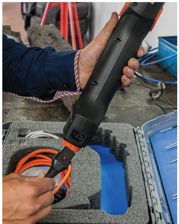
Unique application of IEC Lock plug with electrical hand tool